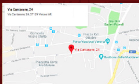
Via Cantarane, 24, 37129 Verona (VR)

22 May, 3 pm: Room SMT6 – Santa Marta 23 May, 9 am and 3 pm: Room SPC – Silos di Ponente 24 May, 9 am and 3 pm: Room SMT6 – Santa Marta 25 May, 9 am: Teatro Laboratorio – Arsenale Asburgico